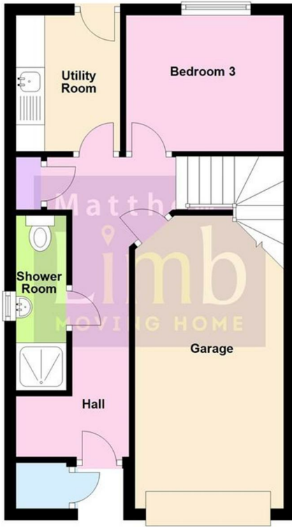
Ground Floor Approx. 421.2 sq. feet