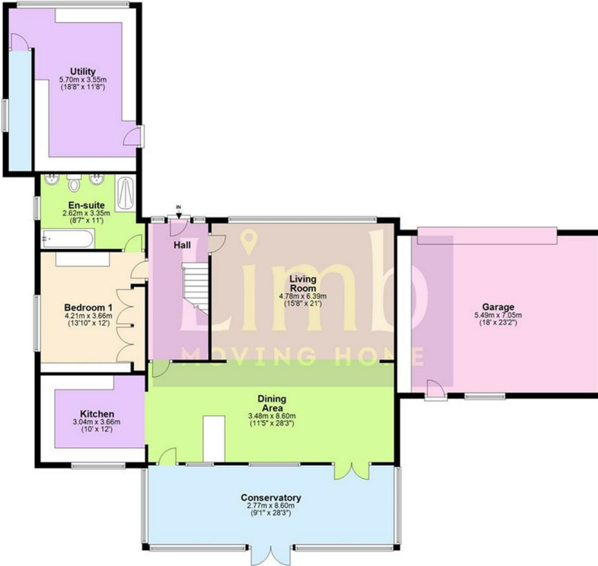
Ground Floor Approx. 198.7 sq. metres (2139.3 sq. feet)