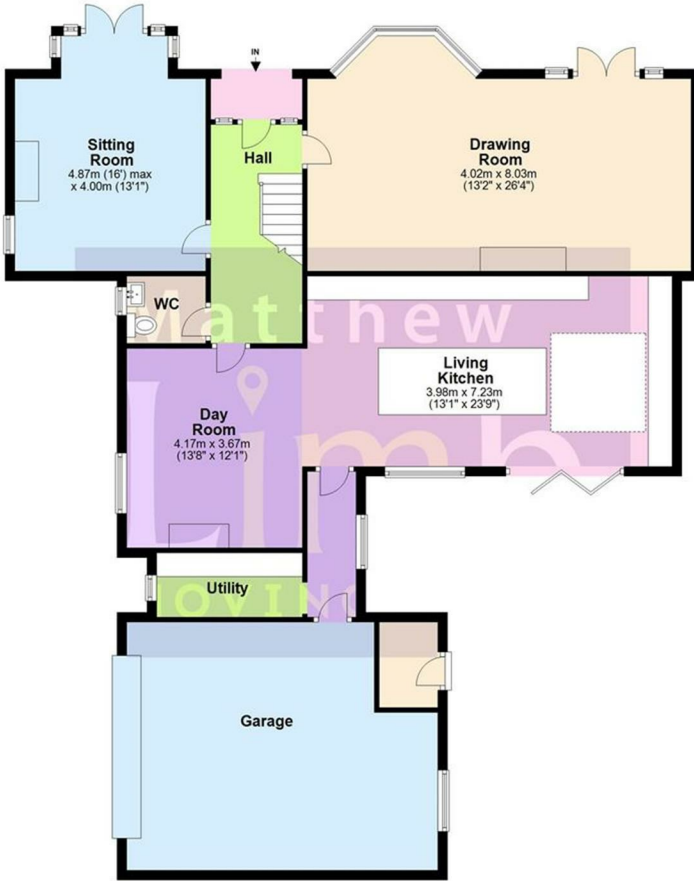
Ground Floor Approx. 154.3 sq. metres (1661.0 sq. feet)