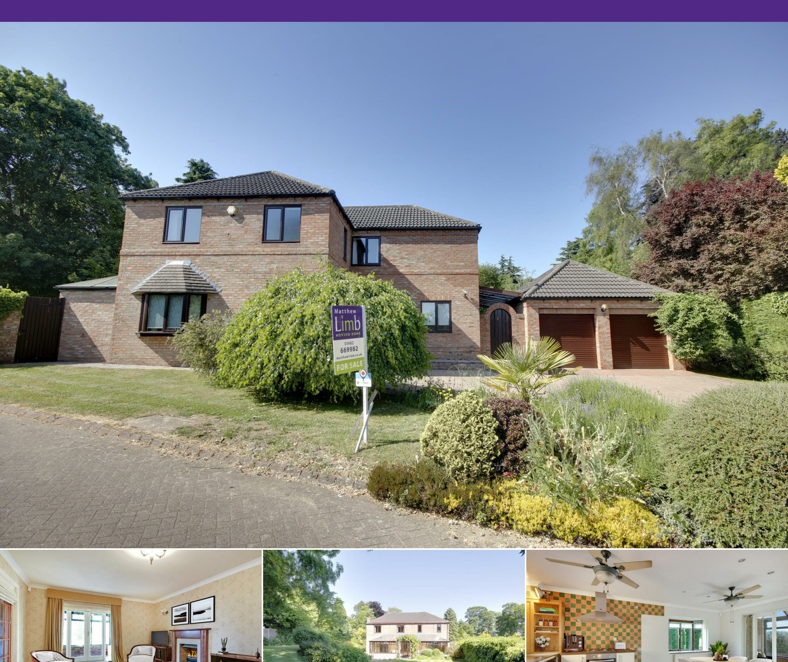
'Broxa', 18 Swanland Garth, North Ferriby, East Yorkshire, HU14 3LL