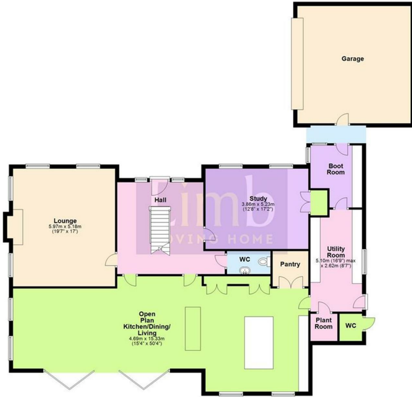
Ground Floor Approx. 218.8 sq. metres (2355.6 sq. feet)