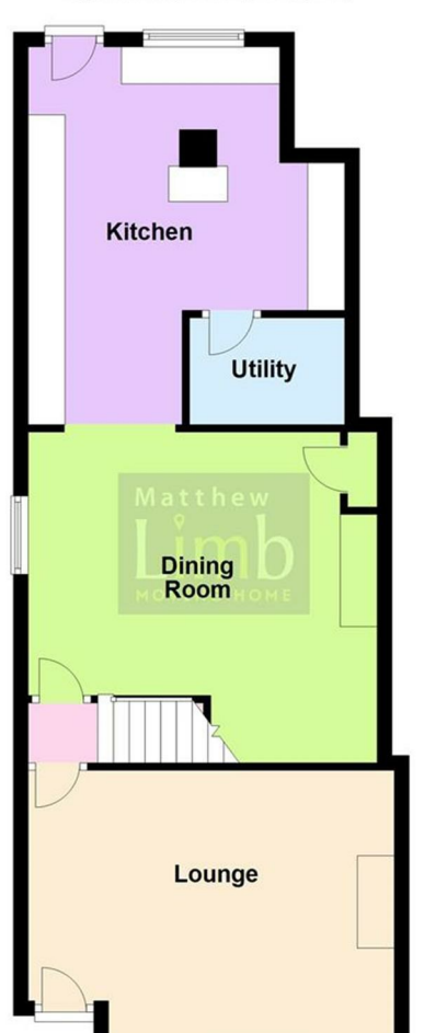
First Floor Approx. 60.5 sq. metres (650.8 sq. feet)