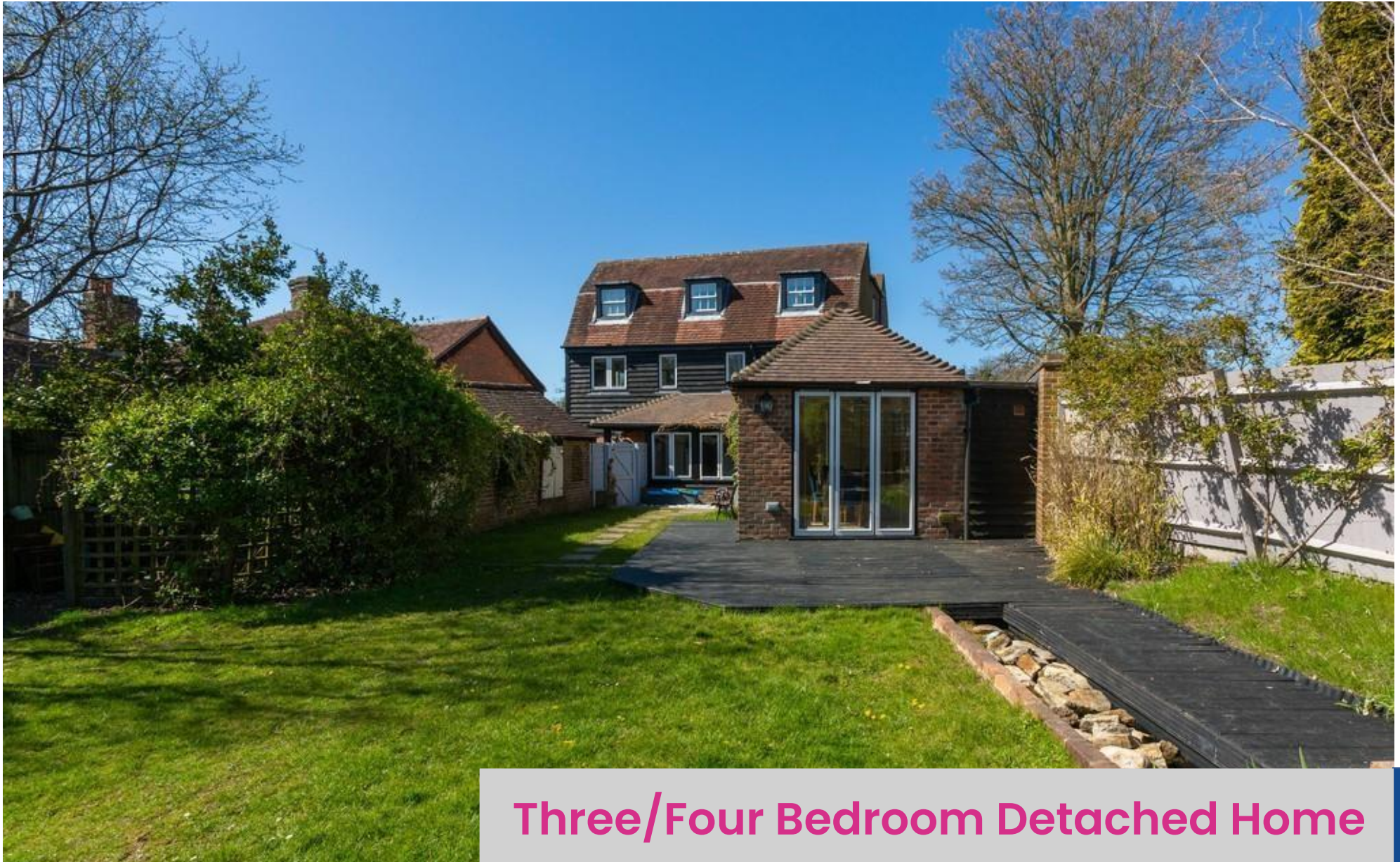
Three/Four Bedroom Detached Home

The Green, Sedlescombe, Battle, East Sussex, TN33 0QA