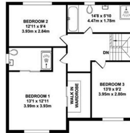
FIRST FLOOR APPROX. FLOOR AREA 744 SQ.FT. (69.09 SQ.M.)

TOTAL APPROX. FLOOR AREA 2103 SQ.FT. (195.35 SQ.M.)