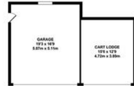
OUTBUILDING APPROX. FLOOR AREA 520 SQ.FT. (48.30 SQ.M.)

TOTAL APPROX. FLOOR AREA 2322 SQ.FT. (215.70 SQ.M.)