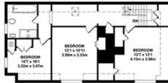
FIRST FLOOR APPROX. FLOOR AREA 756 SQ.FT. (70.26 SQ.M.)