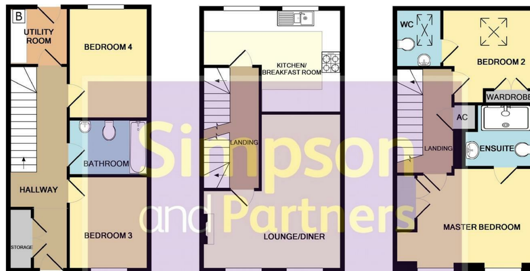
GROUND FLOOR APPROX. FLOOR AREA 420 SQ.FT. (39.0 SQ.M.)