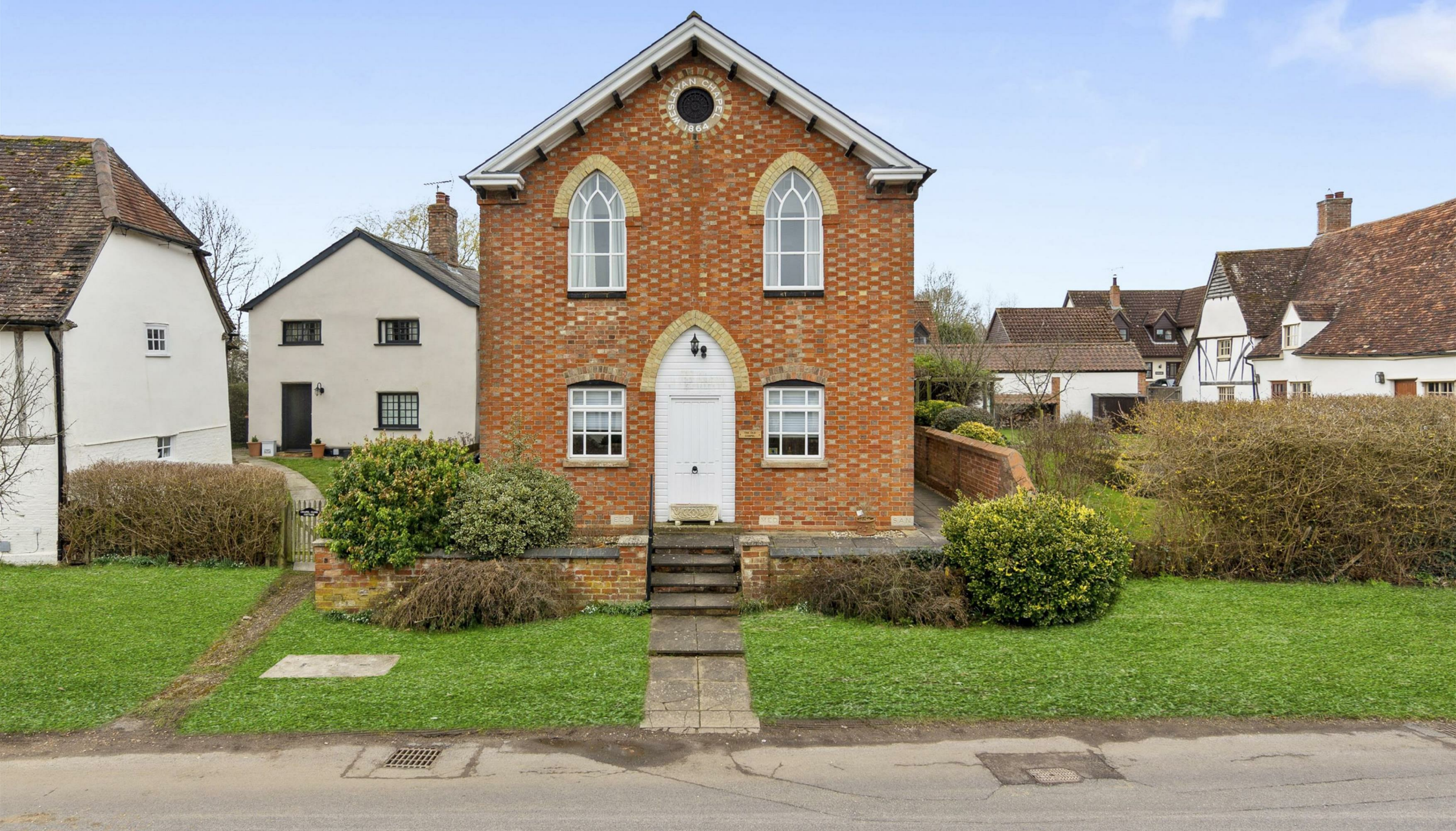
The Old Chapel High Street Swineshead, Bedford MK44 2AA