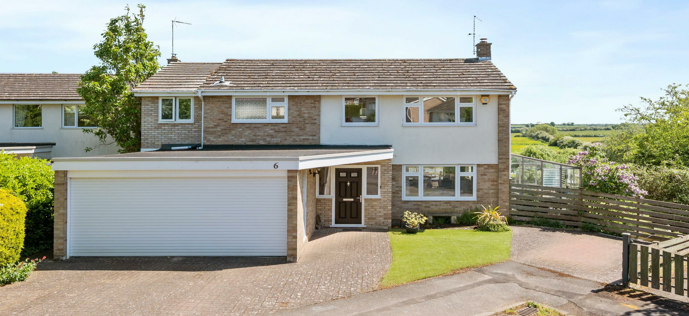
6. The Moorings Woodford, Northants NN14 4HN