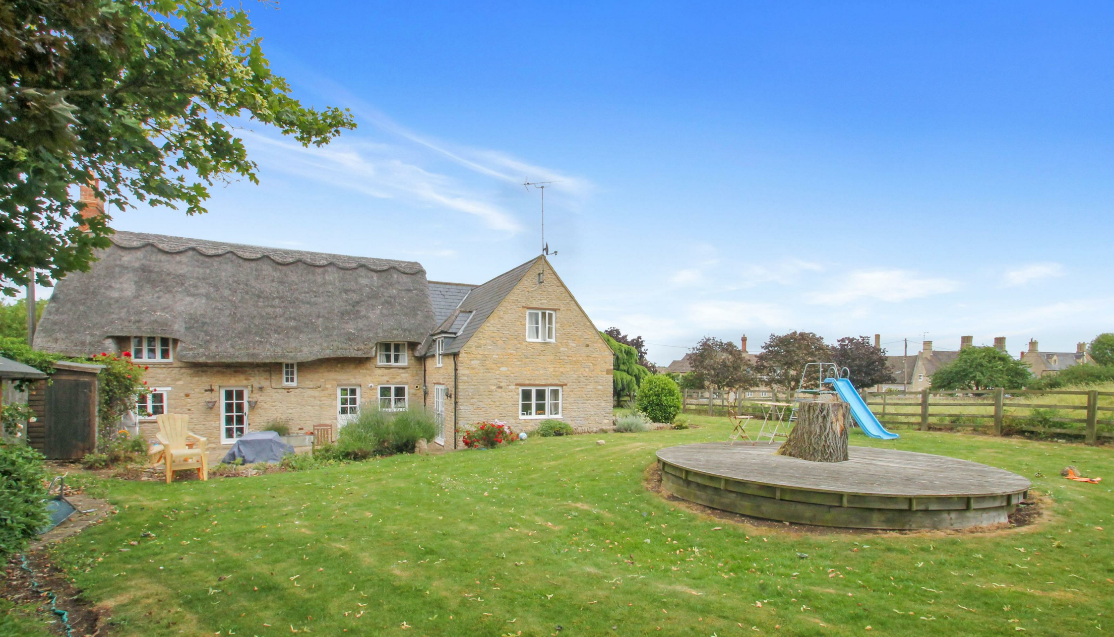
Birds Cottage, 18 High Street Titchmarsh, Northants NN14 3DF