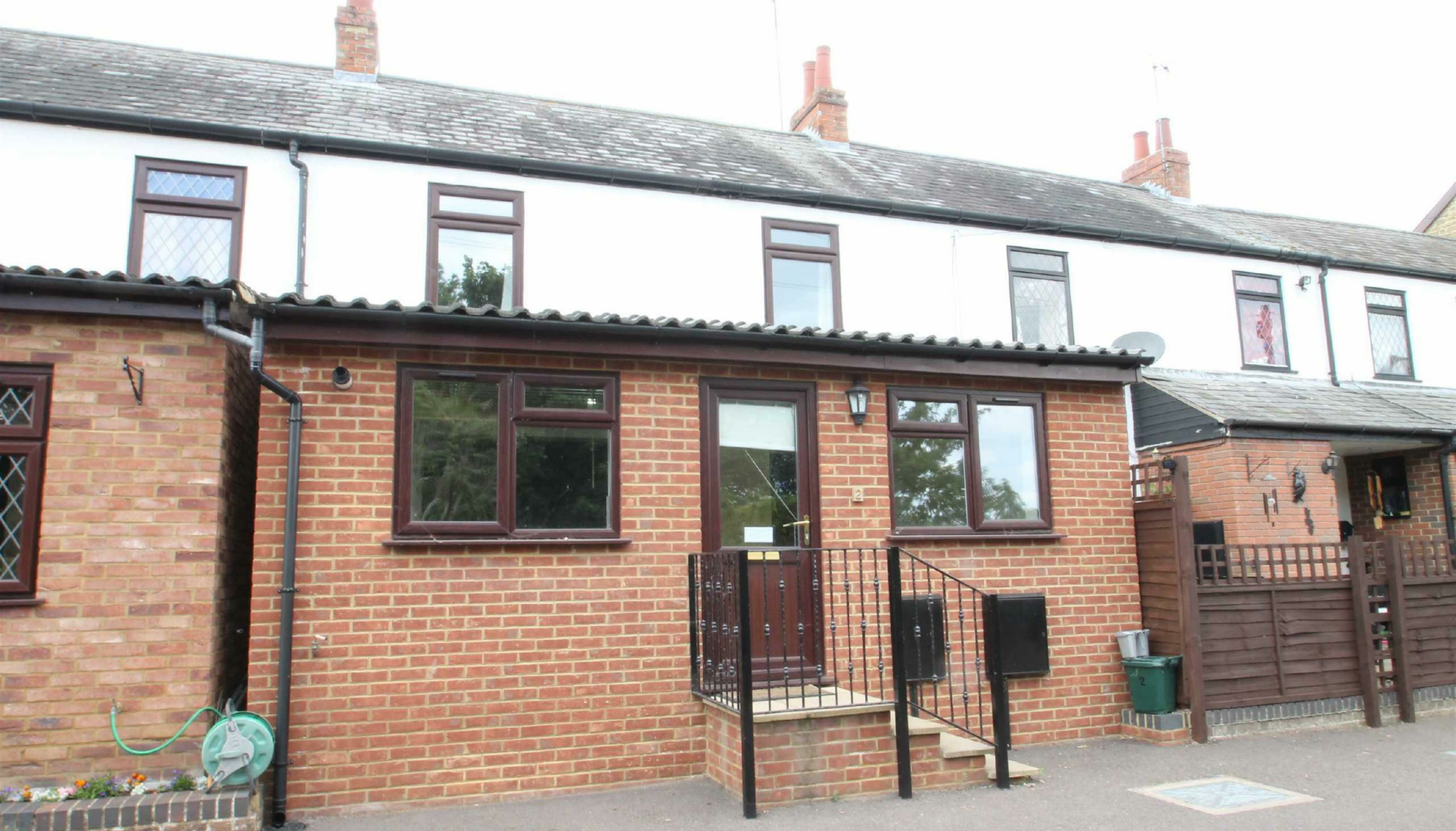
2 Temperance Cottages Raunds, Northants NN9 6JD