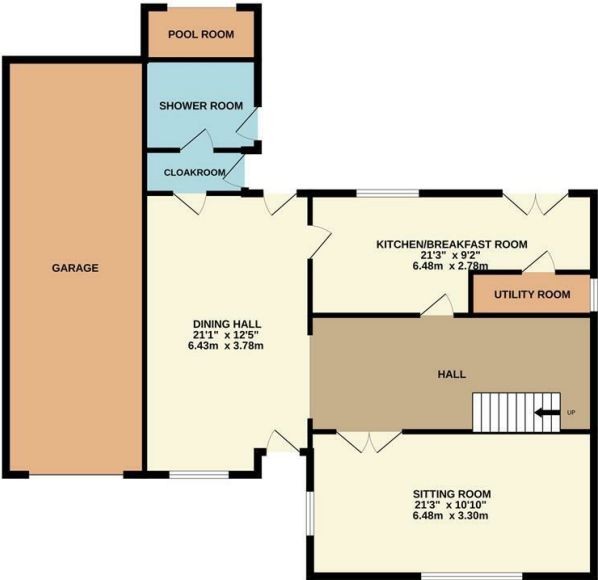
GROUND FLOOR 1303 sq.ft. (121.1 sq.m.) approx.