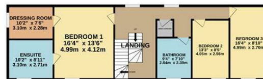
1ST FLOOR 952 sq.ft. (88.4 sq.m.) approx.