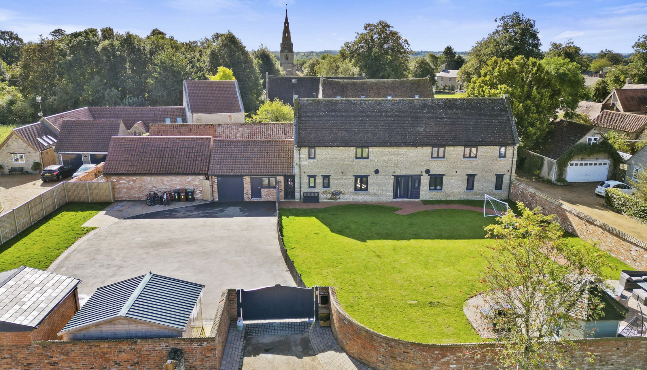
Church Barn Fuller Close Aldwinckle, NN14 3UU