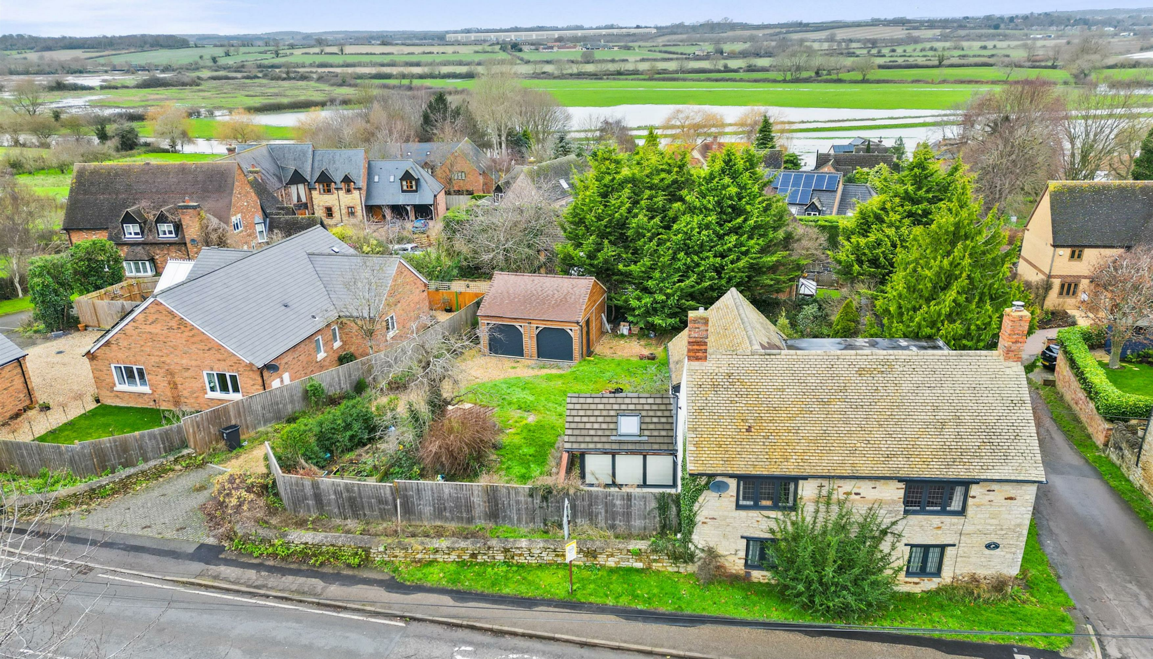
Manor Farm Cottage Ringstead Road Denford, Northants NN14 4EL