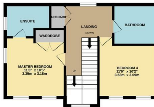
1ST FLOOR 440 sq.ft. (40.9 sq.m.) approx.