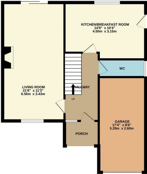
GROUND FLOOR 662 sq.ft. (61.5 sq.m.) approx.