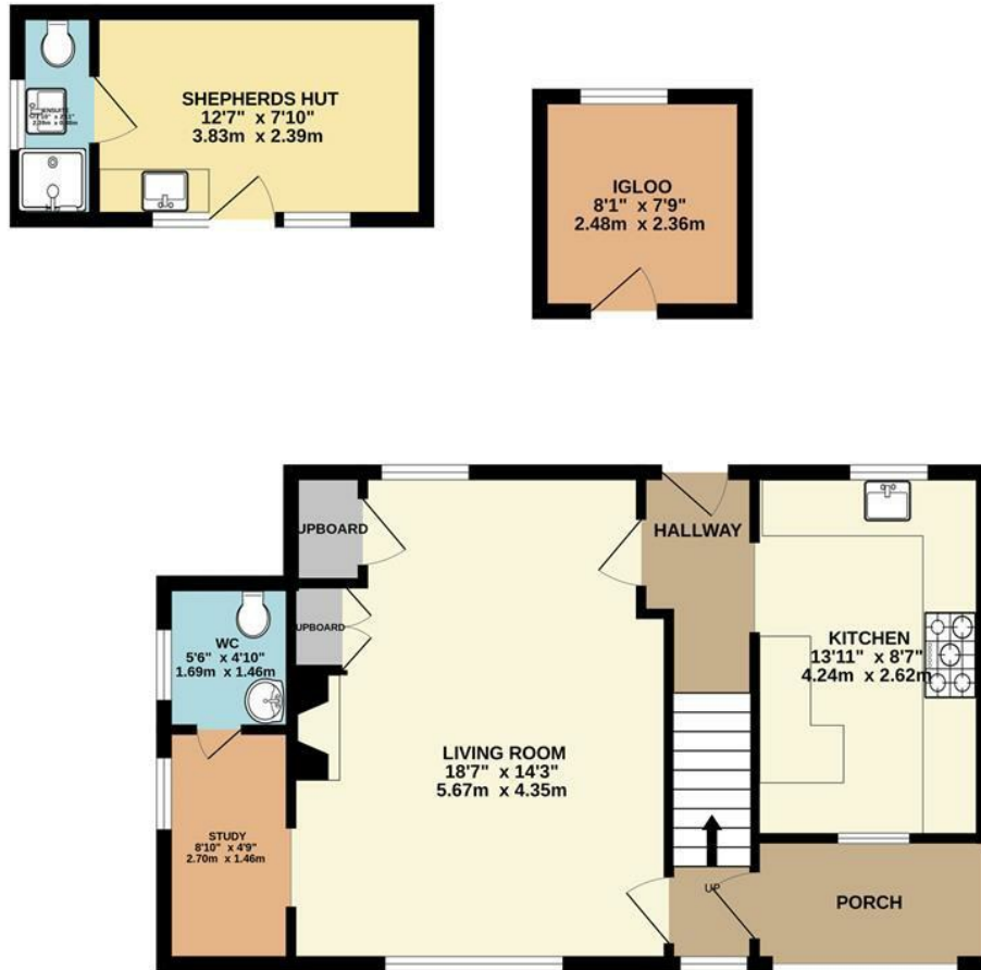
GROUND FLOOR 734 sq.ft. (68.2 sq.m.) approx.