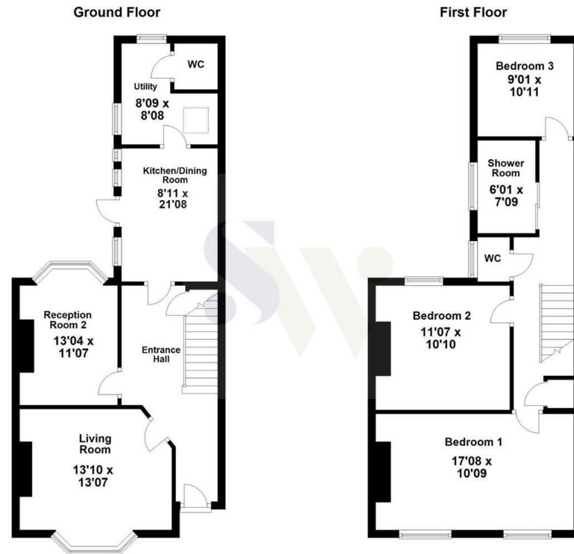
Floor plan not to scale - for guidance purposes only. Plan produced using PlanUp.