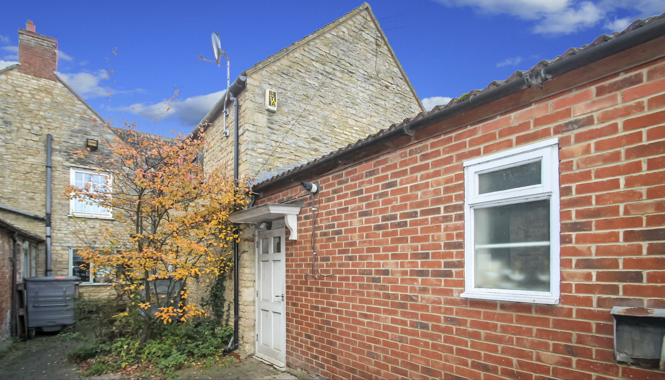
The Bullring Thrapston, Northants NN14 4NP