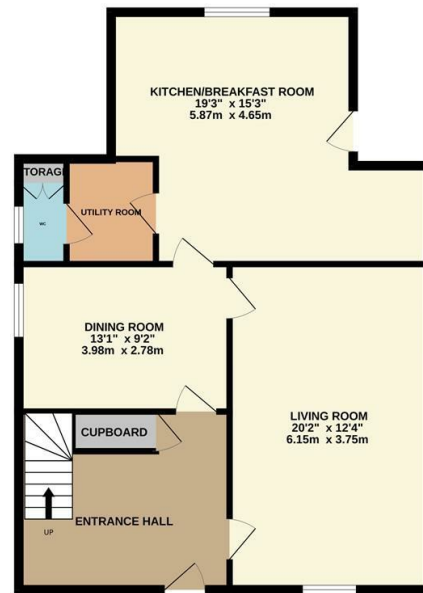
GROUND FLOOR 811 sq.ft. (75.3 sq.m.) approx.