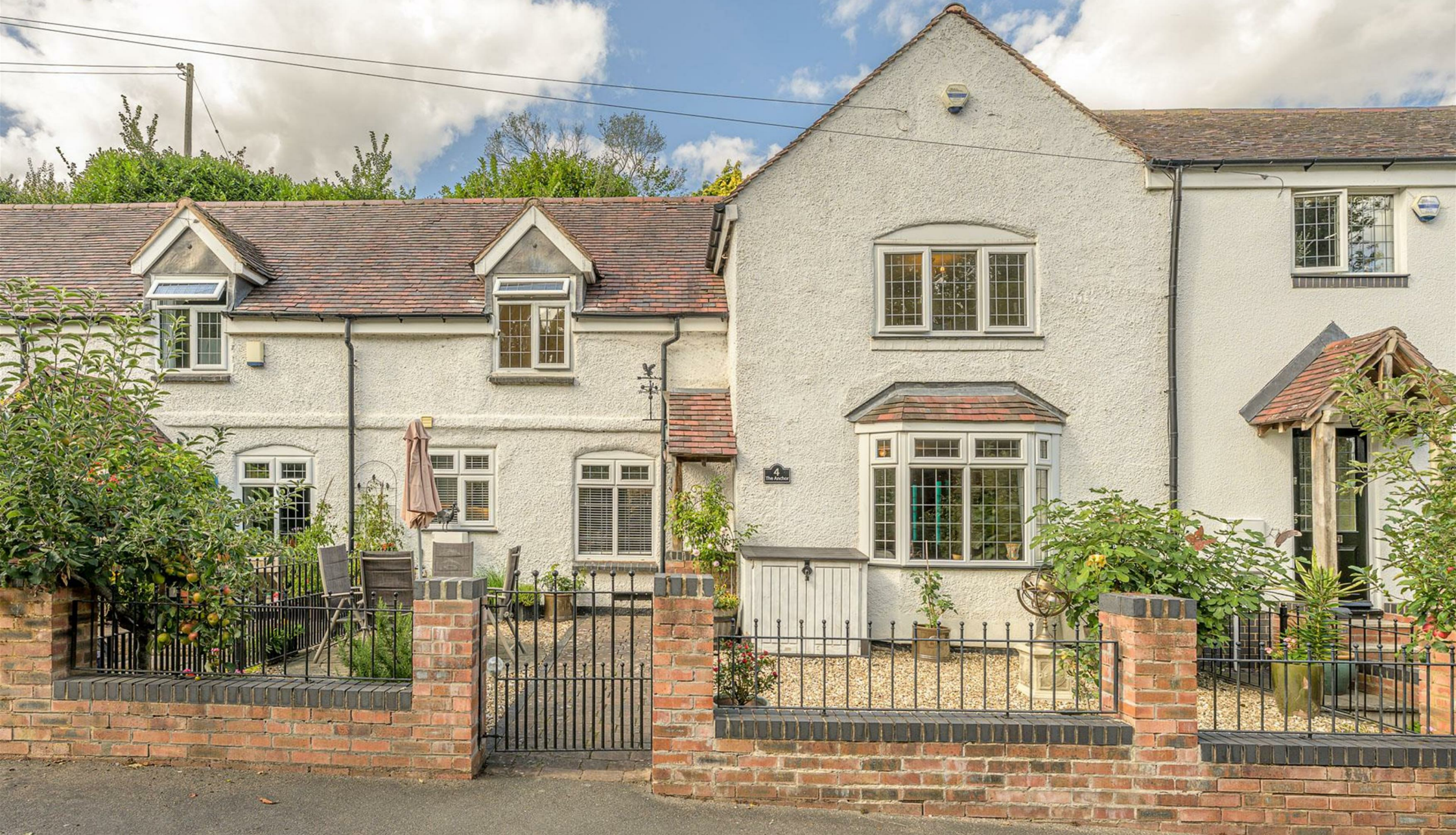
The Anchor, Dark Lane, Kinver, Stourbridge, DY7 6NR