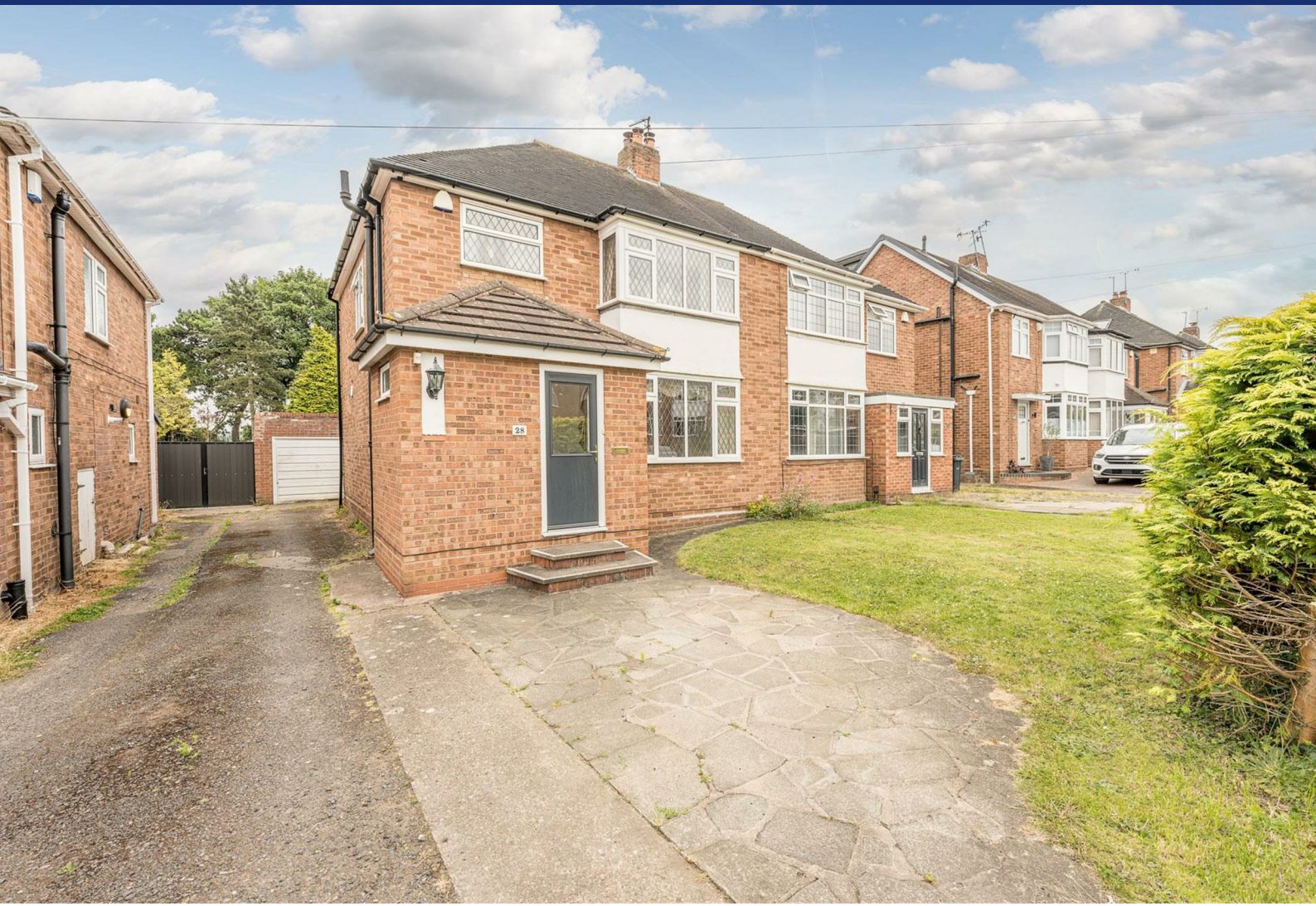
Court Crescent Kingswinford, DY6 9RL