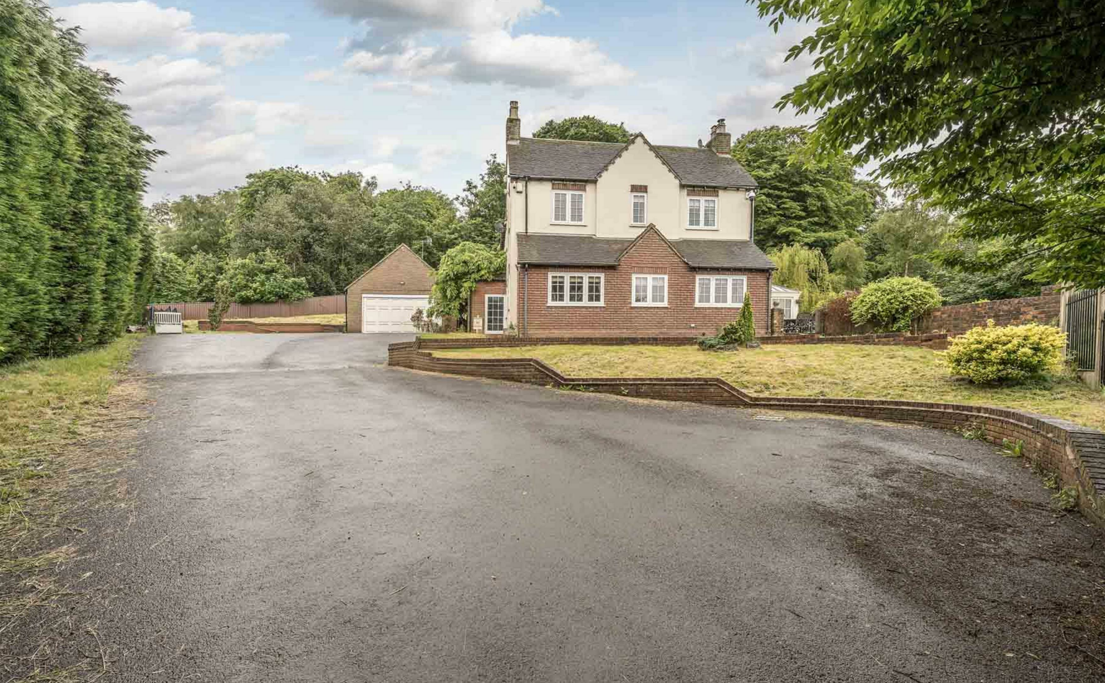
Ridgehill Cottage, Lodge Lane, Kingswinford DY6 9XE