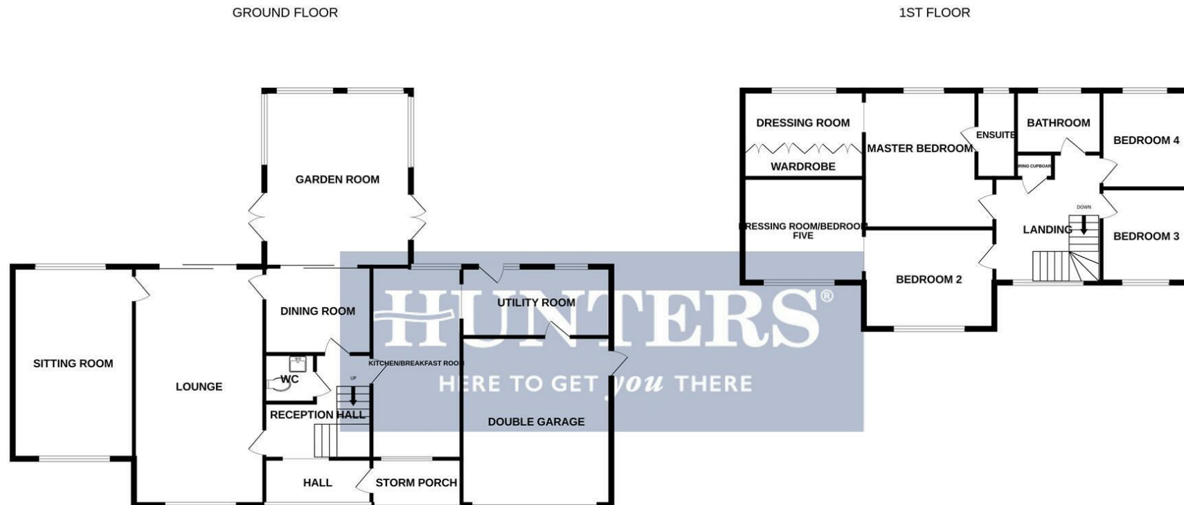
CEDAR LODGE, DY6 9XH

Whilst every attempt has been made to ensure the accuracy of the floorplan contained here, measurements of doors, windows, rooms and any other items are approximate and no responsibility is taken for any error, omission or mis-statement. This plan is for illustrative purposes only and should be used as such by any prospective purchaser. The services, systems and appliances shown have not been tested and no guarantee as to their operability or efficiency can be given. Made with Metropix ©2024