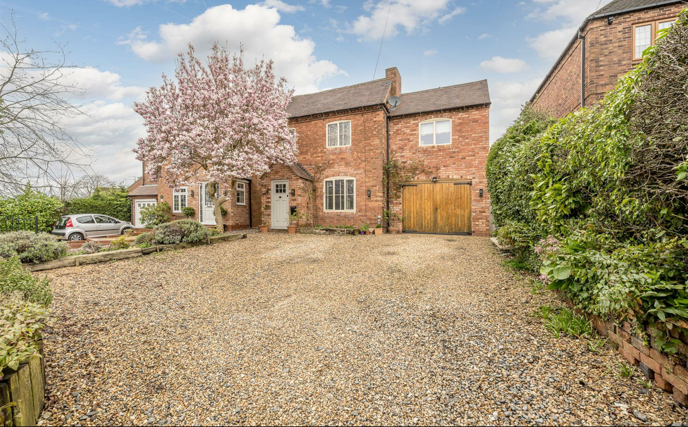
Mill Cottage, Middlefield Lane, Hagley, DY9 0PY