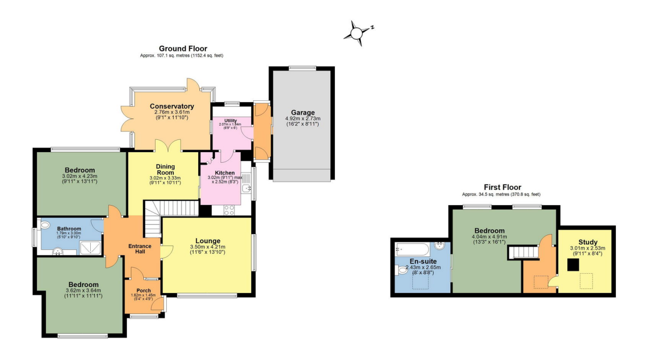
Total area: approx. 141.5 sq. metres (1523.2 sq. feet) These are appropriate dimensions.

A detached 3 bedroom dorma bungalow situated within a small quiet cul-de-sac on the outskirts of Tavistock close to a local bus service. The bungalow has mature, lawned gardens to the front and rear with established trees and shrubs, sheds and storage areas, covered seating and a greenhouse. There is a garage offering additional storage adjacent to the bungalow and there is also driveway parking. Tavistock town centre and local amenities are walkable in about twenty minutes.