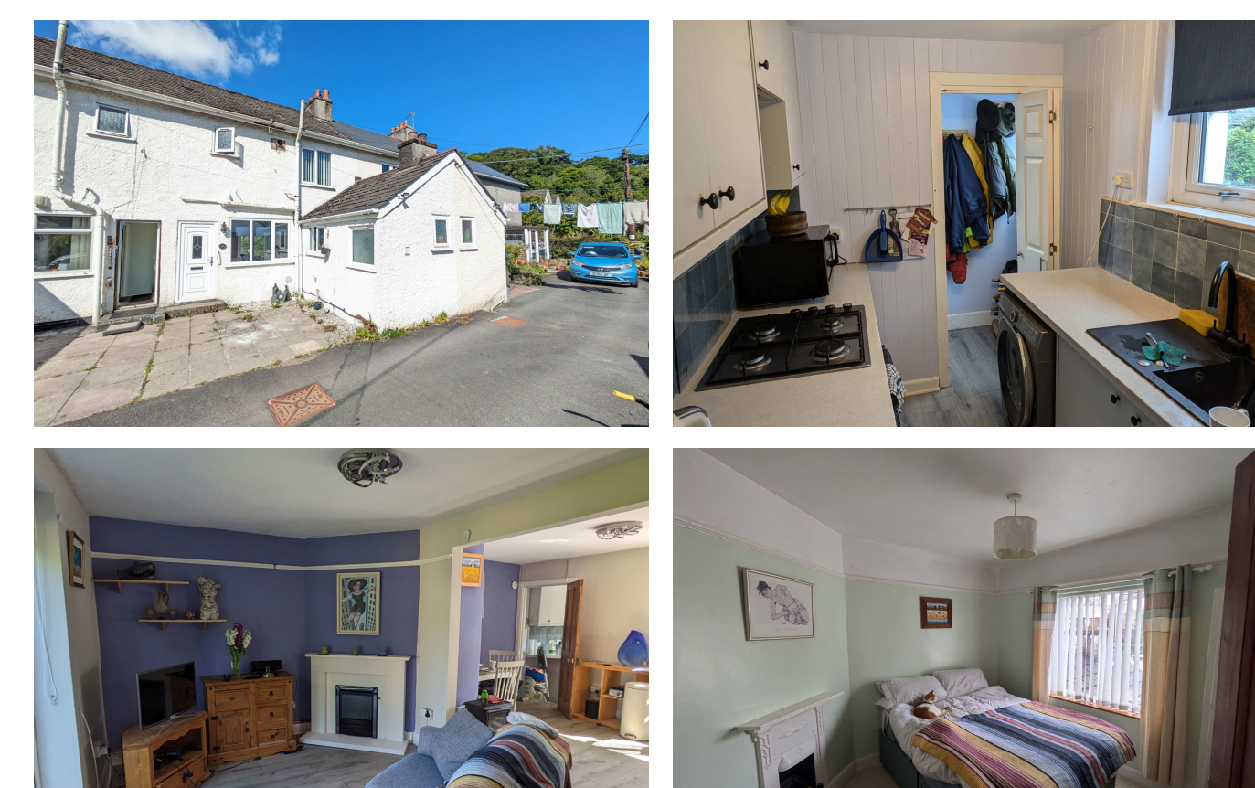
🛤 2 🚰 1 🚍 1