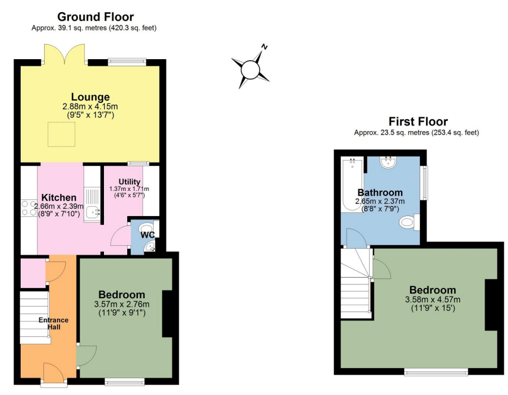
Total area: approx. 62.6 sq. metres (673.8 sq. feet) These are appropriate dimensions. Plan produced using PlanUp.

This pretty terraced cottage offers a flat walk into the town centre of Tavistock with all the amenities that the Historic Market town has to offer. The rear garden must be seen to be appreciated as it is much larger than expected and has been lovingly planted with mature shrubs and trees and leads down to a Summerhouse that overlooks the River Tavy. The property offers flexible accommodation with a Master Bedroom and main bathroom on the first floor and a further bedroom and toilet on the ground floor. The kitchen has been fitted with bespoke oak base units and open shelving for a country cottage feel with a Utility Room with plumbing for a