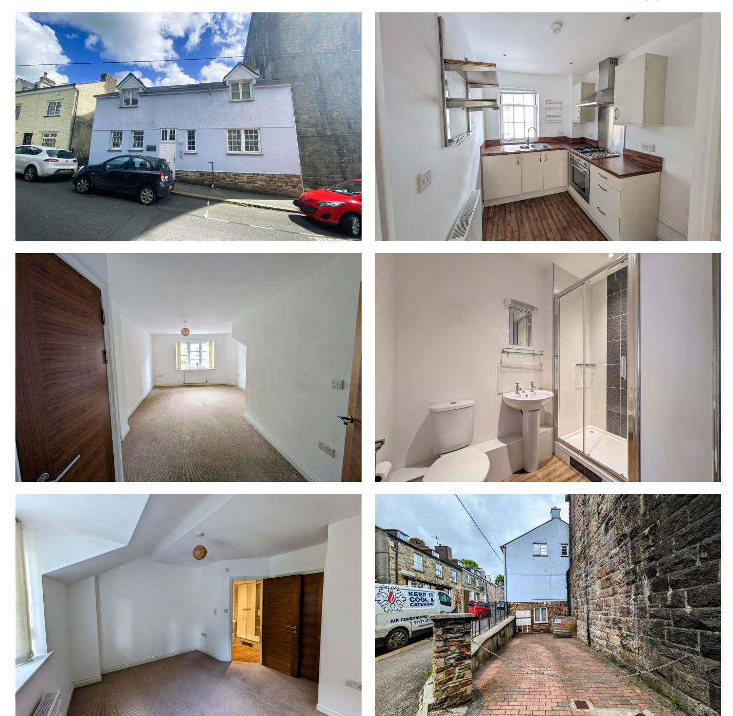
🍋 2 🚰 2 🚍 1