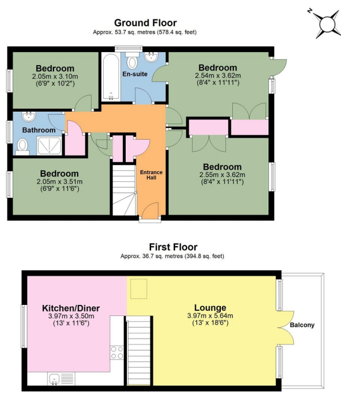
Total area: approx. 90.4 sq. metres (973.2 sq. feet) These are appropriate dimensions. Plan produced using PlanUp.

Whether you are looking for a business investment or just a private get away retreat, this beautifully appointed lodge is set amidst the rolling Cornish countryside. Valley Lodge offers adaptable family space in an accessible location lending itself as an excellent base for day trips, visits or just relaxing in tranquility.