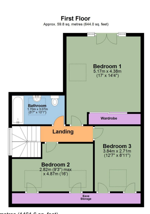
Total area: approx. 135.8 sq. metres (1461.6 sq. feet) These are appropriate dimensions. Plan produced using PlanUp.

A deceptively spacious 3/4 bedroom semi-detached character property which is situated on a private road in Plympton. The property offers a generous amount of ground floor living space with the potential for multi-generational living due to the 4th bedroom/Study and a bathroom on the ground floor. The property has been extended and renovated by the current vendors to create spacious living accommodation whilst still retaining the original character and charm of the property.