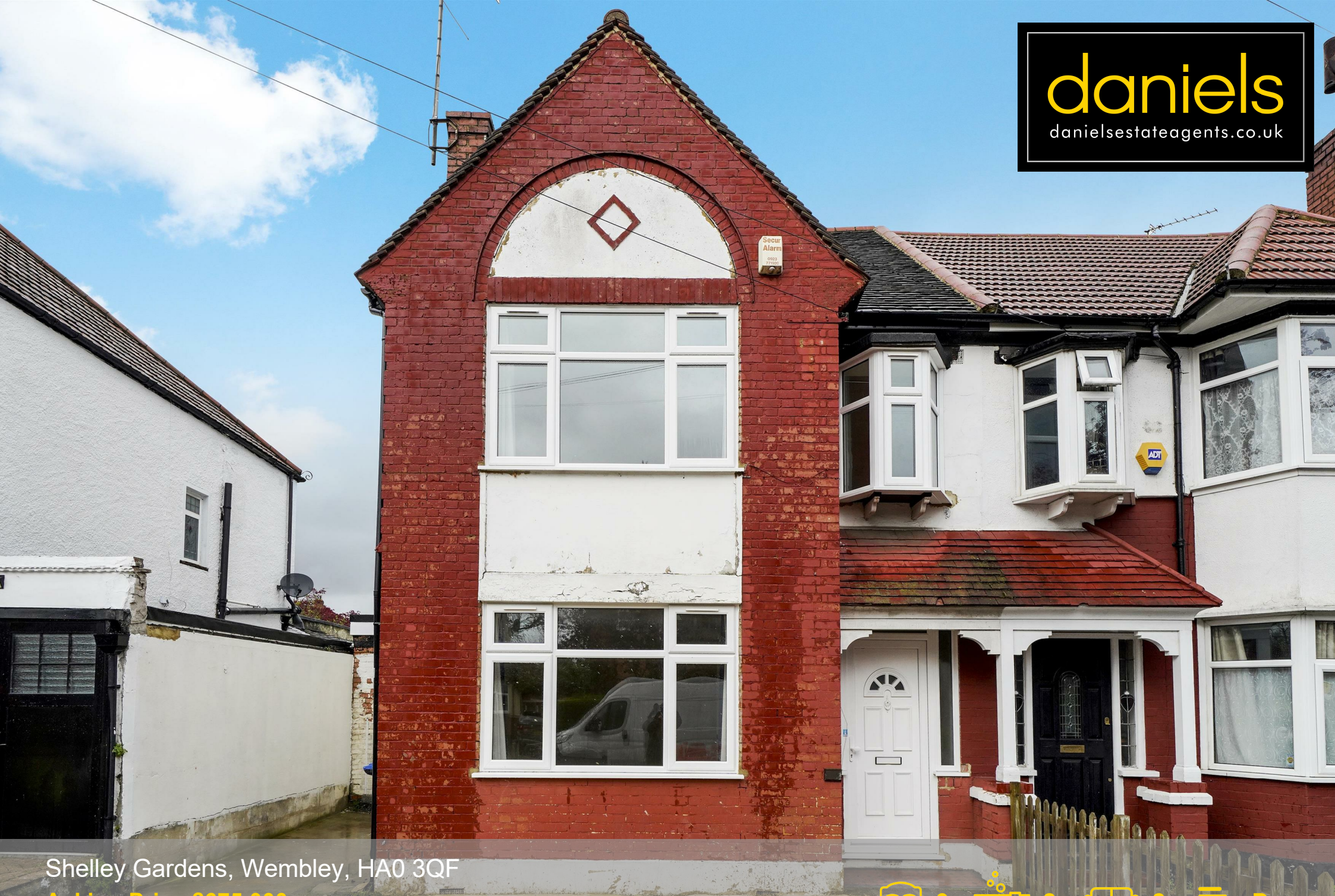
Shelley Gardens, Wembley, HA0 3QF Asking Price £675,000