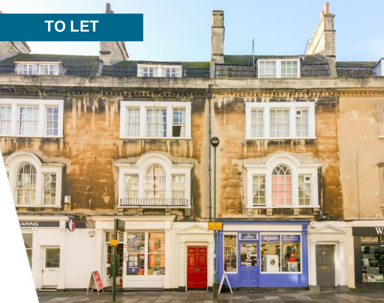
St James's Parade, BATH £2,100 pcm