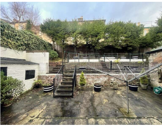
Detached Villa 12 Kelvinside Gardens, North Kelvinside, G20 6BB Offers in the region of £875,000