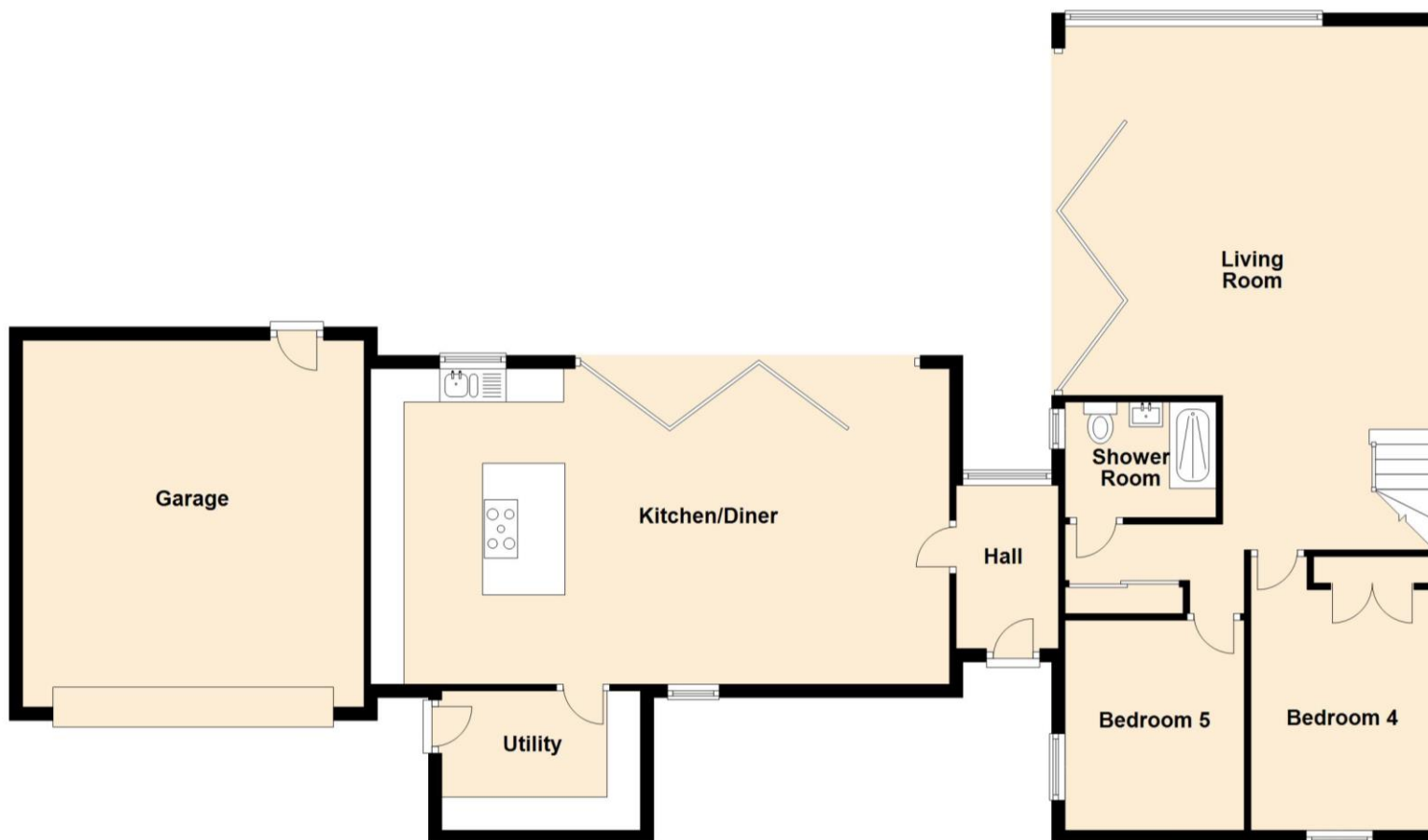
Ground Floor Approx. 147.6 sq. metres (1588.9 sq. feet)