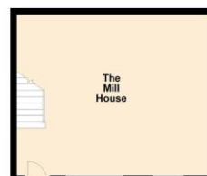
Ground Floor Approx. 31.8 sq. metres (342.5 sq. feet)