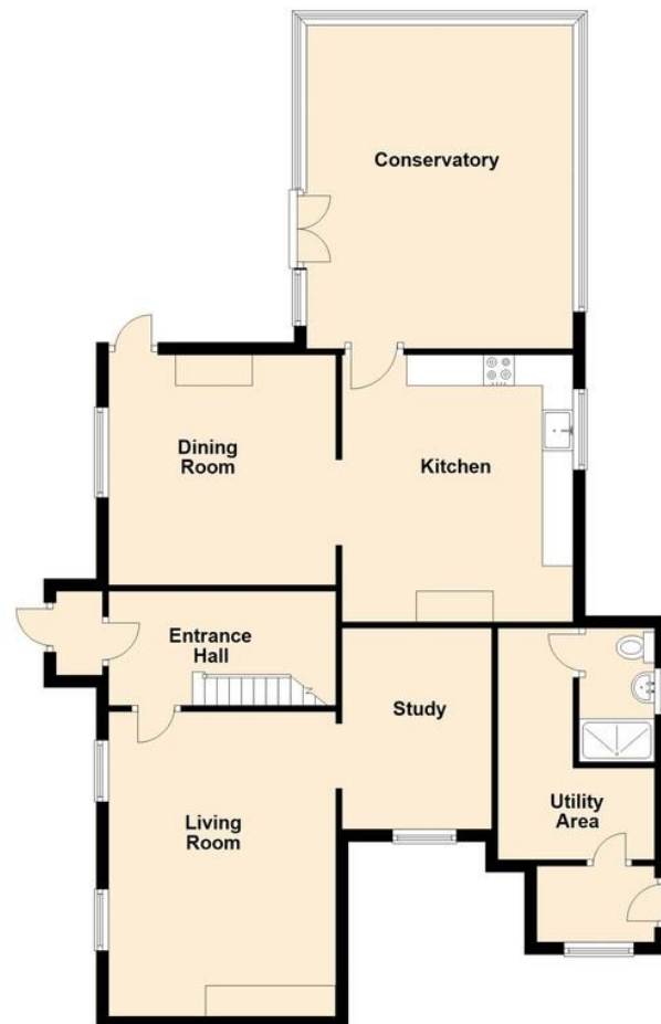
Ground Floor Approx. 102.1 sq. metres (1099.0 sq. feet)