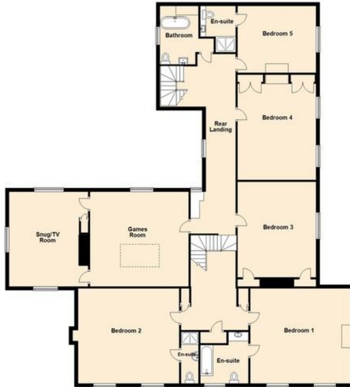
First Floor Approx. 244.3 sq. metres (2629.9 sq. feet)