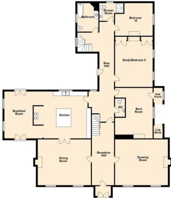
Ground Floor Approx. 250.9 sq. metres (2709.4 sq. feet)