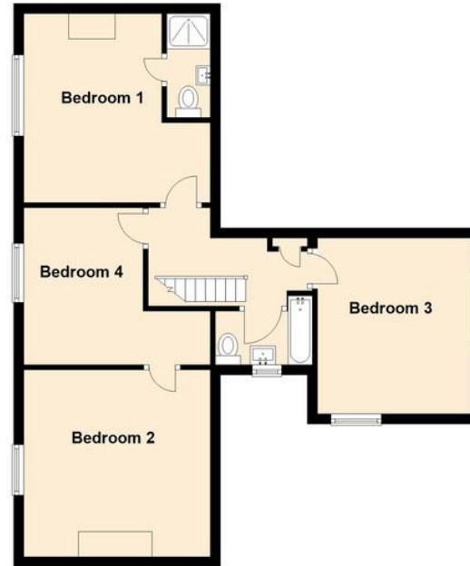
First Floor Approx. 55.8 sq. metres (600.2 sq. feet)