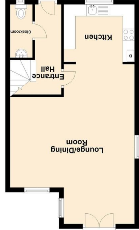
Ground Floor Approx. 46.1 sq. metres (496.6 sq. feet)

Total area: approx. 92.0 sq. metres (990.7 sq. feet)