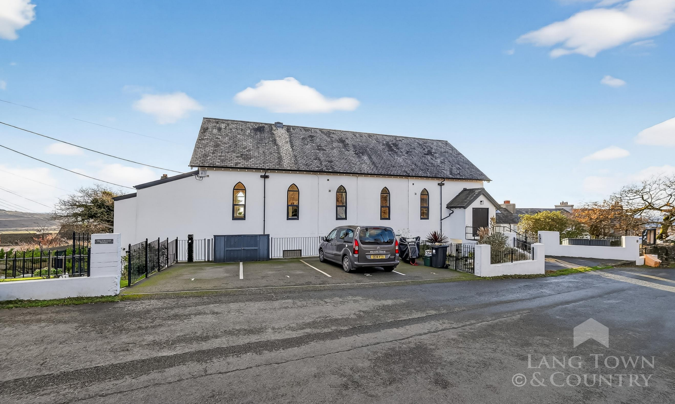
The Church House , Wotter, Plymouth, Devon, PL7 5HN