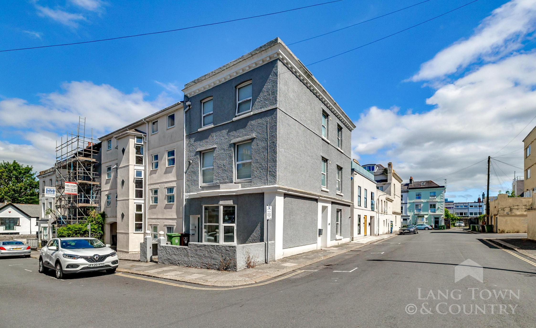
Ground Floor Flat, 19 St. James Place West, The Hoe, Plymouth, Devon, PL1 3AT