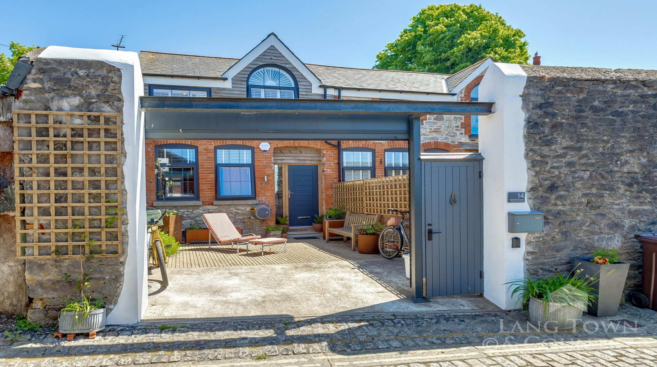
14 Bantham Mews, Mutley, Plymouth, Devon, PL4 6BT