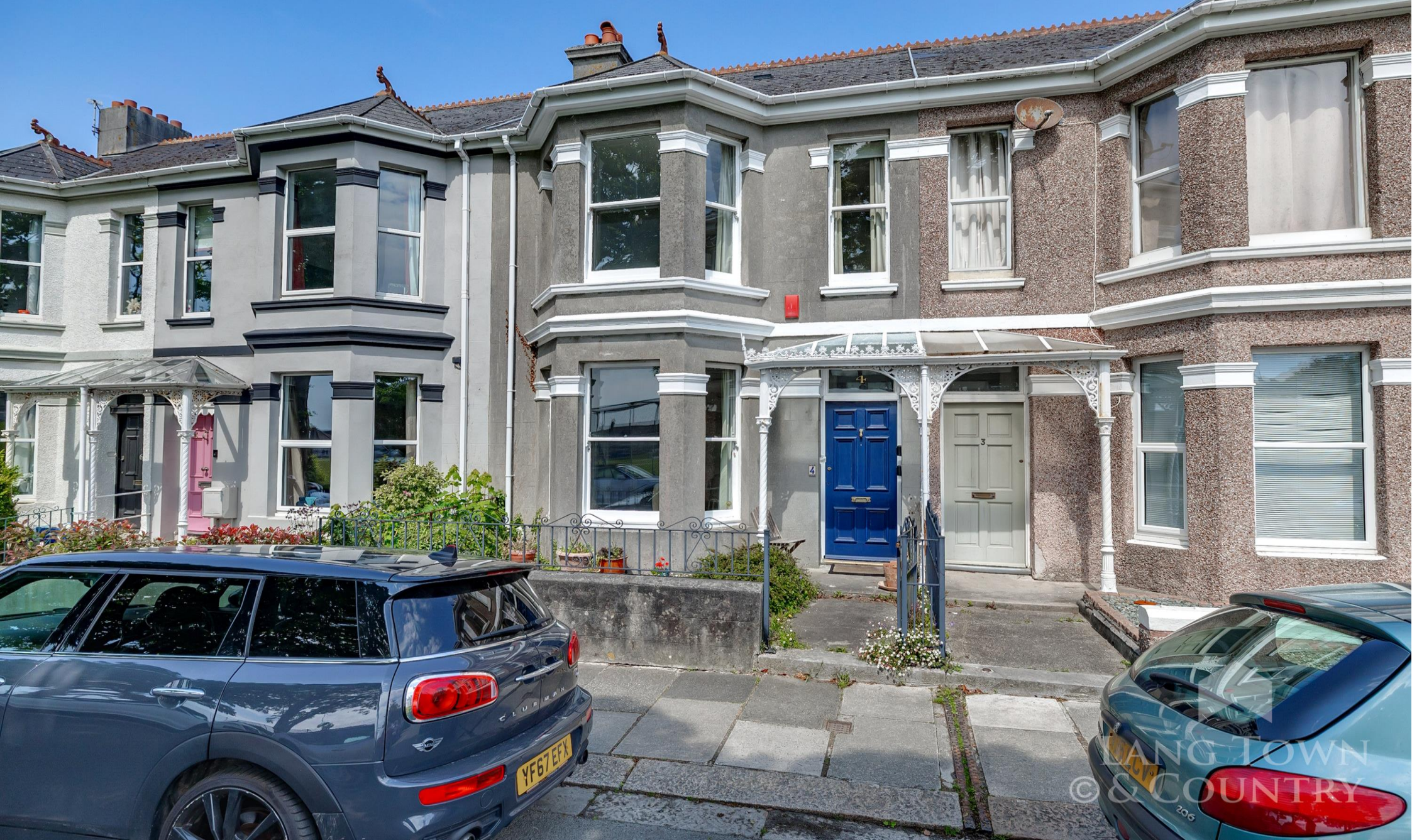
4 Devon Terrace, Peverell, Plymouth, Devon, PL3 4JD