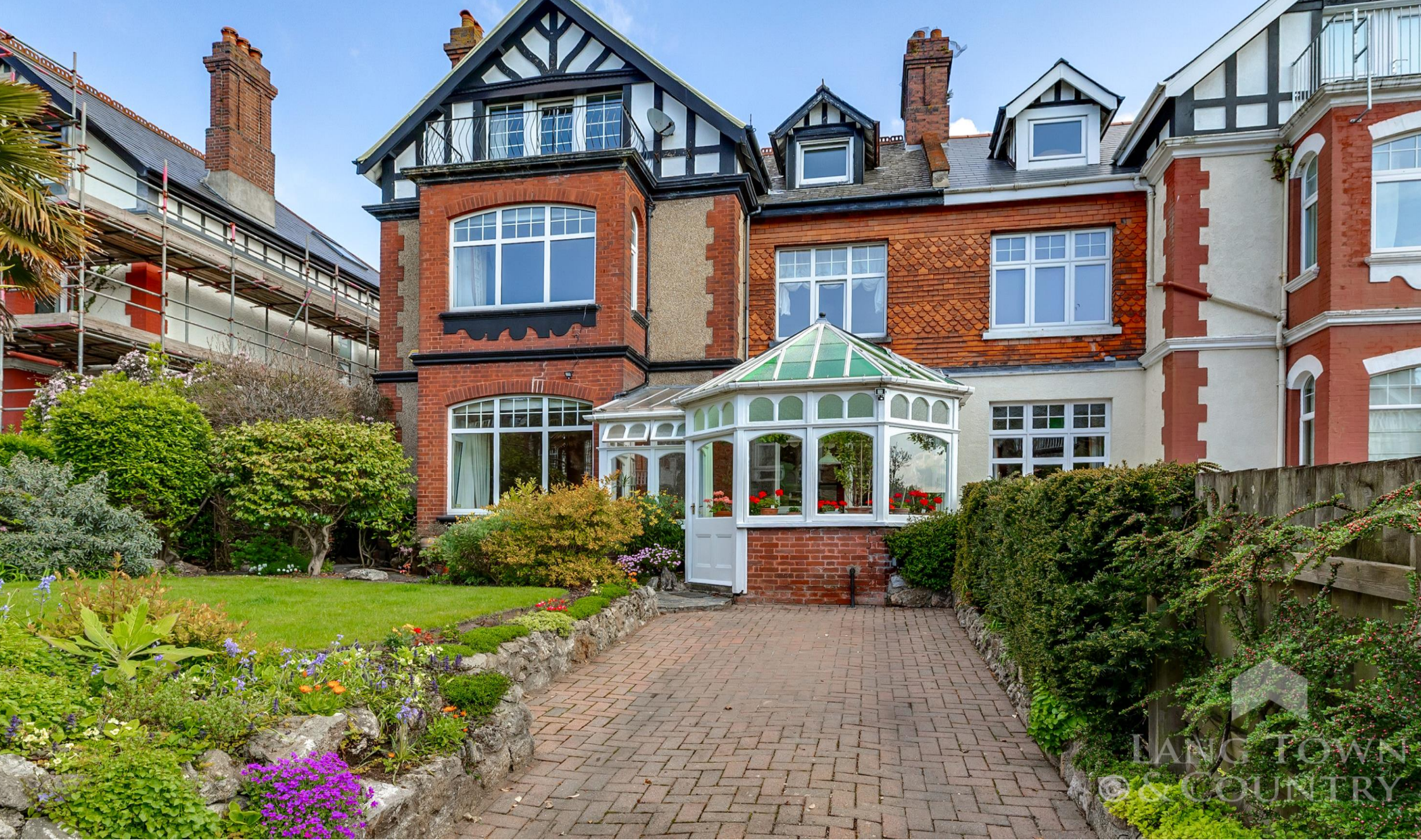
Holly Lodge, 2 Queens Road, Lipson, Plymouth, Devon, PL4 7PJ