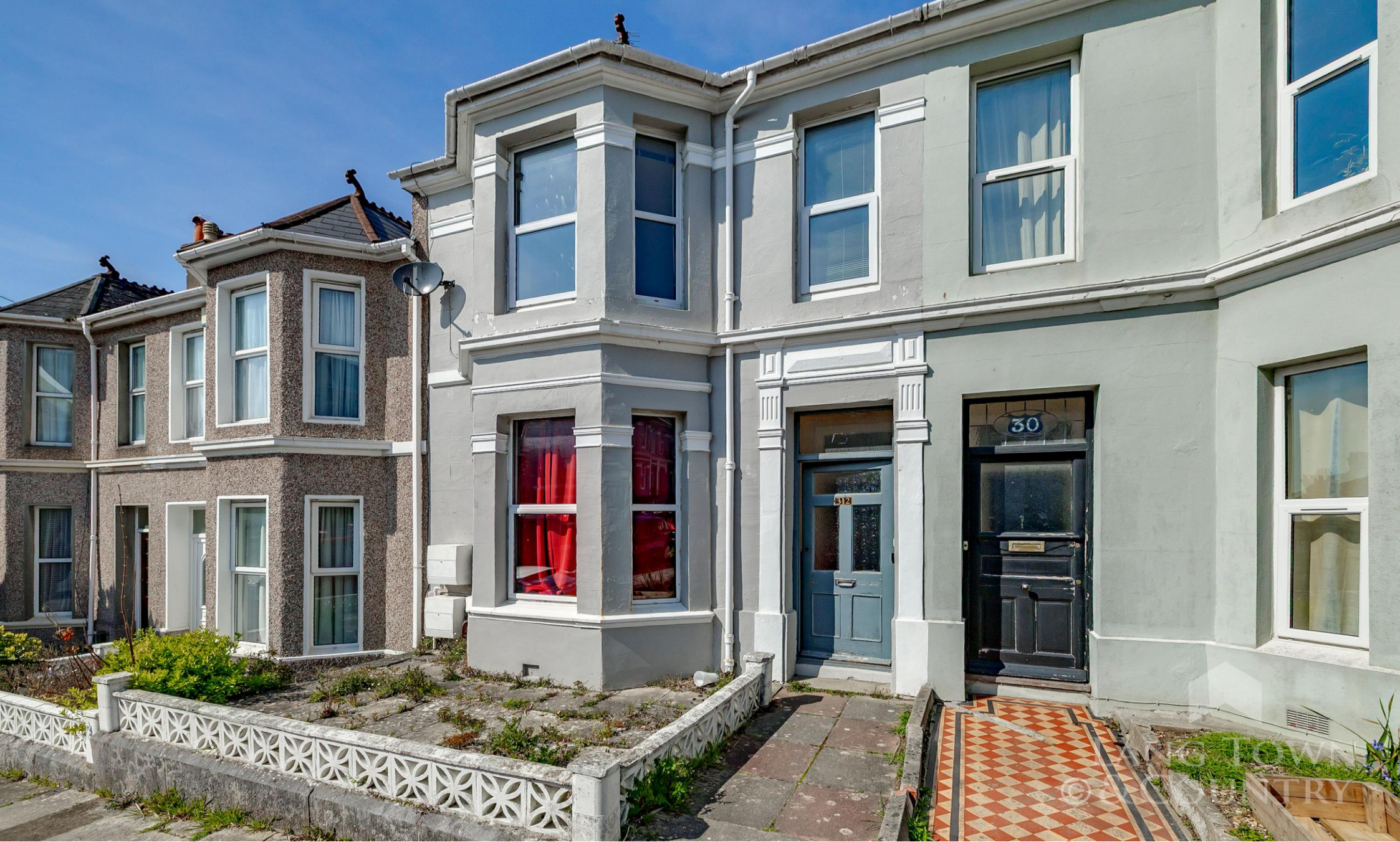
First Floor Flat, 32 Westbourne Road, Peverell, Plymouth, Devon, PL3 4LJ