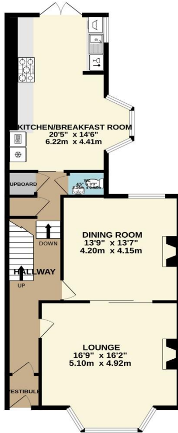
GROUND FLOOR 836 sq.ft. (77.7 sq.m.) approx.